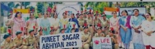
NCC cadets posing for photograph with faculty members during a rally.