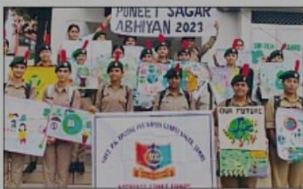
NCC cadets of GCW Gandhi Nagar posing for a group photograph on Wednesday.

JAMMU, APR 19: To Commemorate 'Earth Day' under the banner of Puneet Sagar Abhiyan, a group of 32 cadets of 2 J&K Girls Bn, NCC wing of Padma Shri Padma Sachdev Government College for Women Gandhinagar, Jammu participated in Poster-Making on this year's theme of Earth Day 'Invest in our Earth'. The aim of the activity was to raise an alarm especially among the Youth that a little investment by them today can preserve and protect our health, families and livelihood in future. The duo of concern and imagination mingled with colors was reflected in the posters made by cadets who will definitely